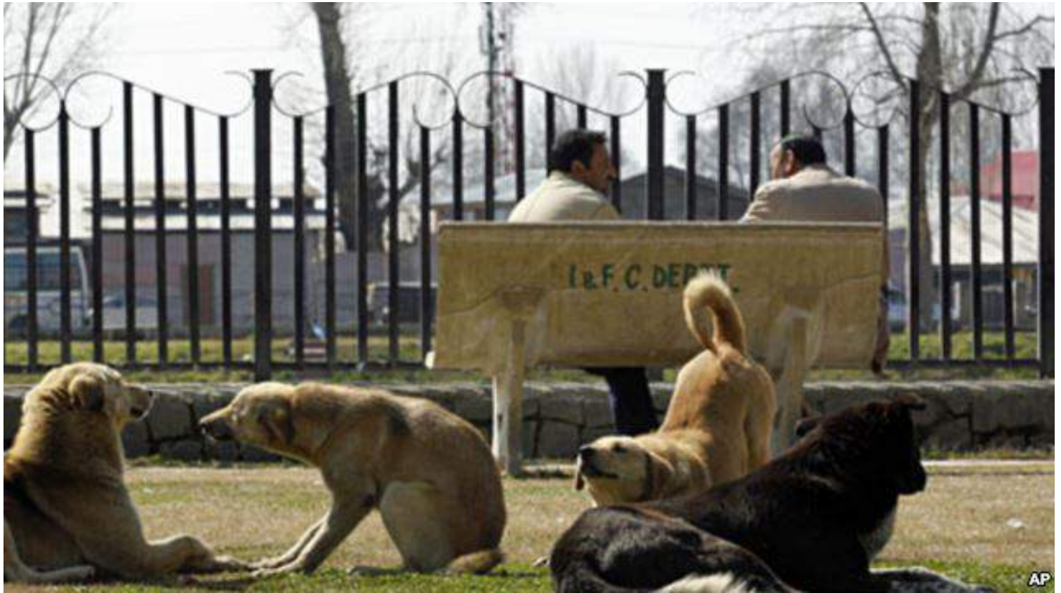
Stray dogs rest at a park in Srinagar, March 2, 2012. Srinagar, India